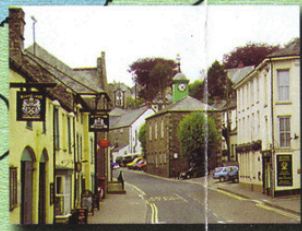
6. CAMELFORD: Legendary site of Camelot. Beautiful market town with free parking for local shops, pubs, park and Tourist Information Centre.

Please respect this historic landscape. Keep dogs on a lead, close gates behind you and take your litter home. Thank You.