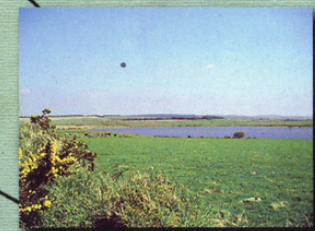
8. DOZMARY POOL: After the last battle of Camlann (The Arthurian Centre), Arthur requested that Sir Bedivere return Excalibur to the Lady of the Lake, here.