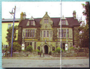
2. KING ARTHUR'S GREAT HALLS: Beautiful stained glass windows and displays depicting the mediaeval Arthurian romances.