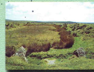
7. BODMIN MOOR: Many sites with Arthurian connections.

Please respect this historic landscape. Keep dogs on a lead, close gates behind you and take your litter home. Thank You.