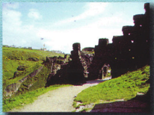
1. TINTAGEL: Legendary birthplace and coastal stronghold of Arthur.