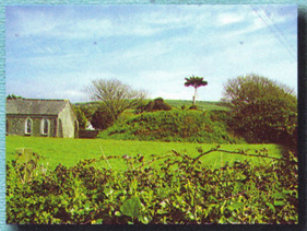
3. BOSSINEY MOUND: One great legend says that on Midsummer's Eve the Round Table like "shimmering silver" hovers above this ancient site.