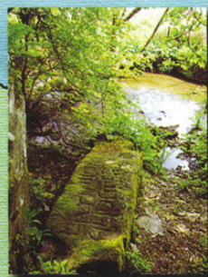
5. SLAUGHTERBRIDGE: Site of 6 th century 'King Arthur's Stone' marking the site of Arthur and Mordred's last battle of Camlann. Many stories are told through art, literature and video in The Land of Arthur Exhibition.